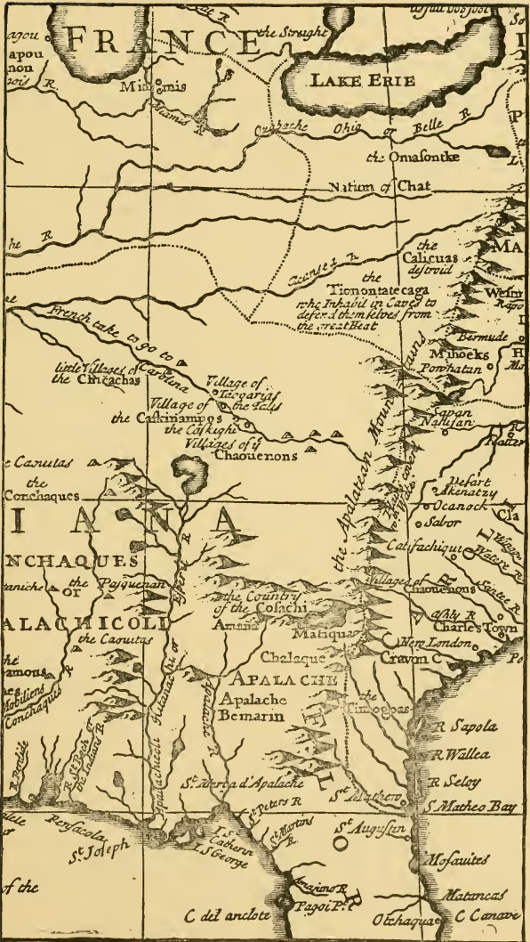
SHOWING LOCATION OF INDIAN TRIBES.